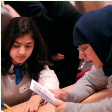
Students at an Ecsite-UK workshop on vaccinations

In 2006, the Council worked with the Centre to produce resources for teachers on the topic of research involving animals. At present, there is little guidance on which subject this topic should fit into or how to structure the lesson. A workshop involving a number of science and citizenship teachers took place in June 2006 to discuss the kind of resources that would be most useful. As a result, materials were developed which, it is envisaged, will be piloted in early 2007.