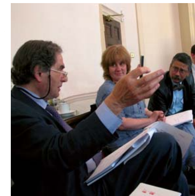
Participants at the Forward Look seminar

The annual Forward Look seminar is when the Council considers topics for future work