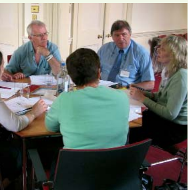
Teachers discussing educational resources on animal research

Director of Education for Citizenship, Nuffield Foundation