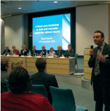
The launch seminar

To coincide with the launch, Kevin Barron MP tabled an Early Day Motion (EDM) outlining the findings of the Report. EDMs are a way of raising awareness of current issues among MPs, who can sign the EDMs that they support. By the end of 2006, Mr Barron’s EDM on the Report had received 46 signatures of support.