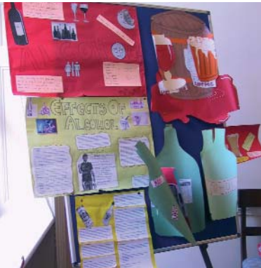
A response to the consultation from a school

The Working Party considered a wide range of responses which were received from individuals and organisations.