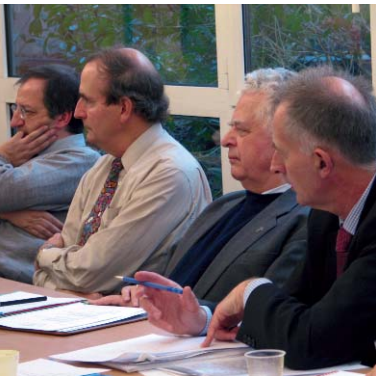
Members of Council and the French CCNE in Paris