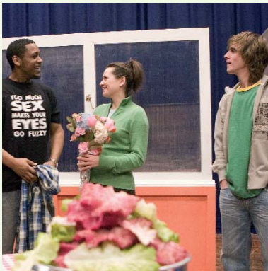
A scene from the play Every Breath

The Council works with Ecsite-UK, the UK Network of Science Centres and Museums, to encourage young people to participate in the Council's work. In 2006, the Council's Working Party on Public health: ethical issues advised Ecsite-UK on the development of a workshop on the ethical issues surrounding vaccination. A total of 503 people aged 14-19 took part in debates about vaccination in schools and four science centres around the country between April and September 2006. The views expressed were reported to the Council during its consultation on the ethics of public health. In 2005, the Council worked with Ecsite-UK to develop workshops on the issues surrounding decision making about the care of premature babies. Several science centres ran this workshop for a second time in 2006 as part of their programmes of events for schools.