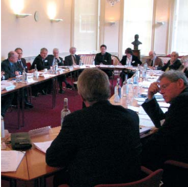
Workshop on the forensic use of bioinformation

The Working Group, which includes members with expertise in law, genetics, philosophy and social science, met for the first time in September 2006. A Discussion Paper setting out the Group's findings will be published in autumn 2007.