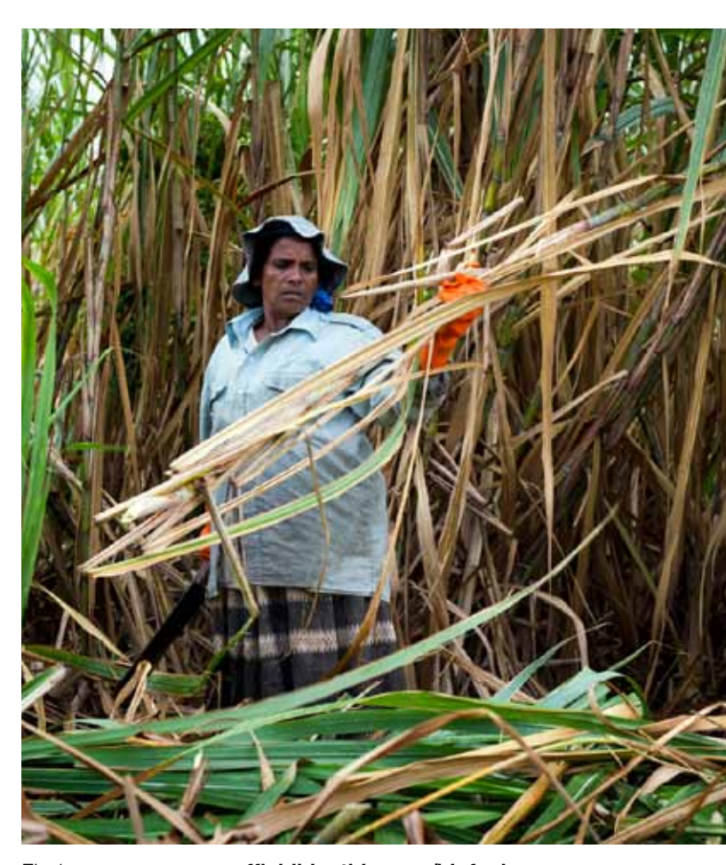
Find out more: www.nuffieldbioethics.ora/biofuels